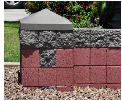
Similar Wall After

Repainting of our common walls is well underway, with project completion expected in about a month.