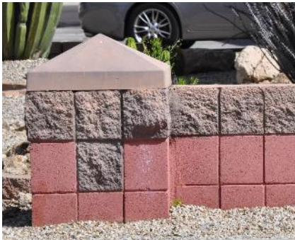
Wall Before Repainting

Repainting of our common walls is well underway, with project completion expected in about a month.